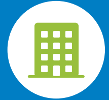
Business Advanced Large