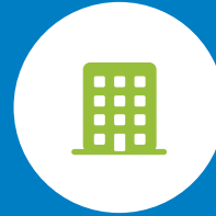
Business Advanced Small