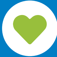
Government, Education, and Non-profit